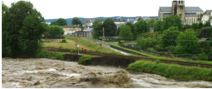
Figure 2. A picture of the railway line, on 18 th June 2013

With a major constraint to reopen the line before August 15 th , reinforcements were studied and applied in order to rebuild and stabilize the railway embankment. Indeed, although the Gave de Pau was still flooded and with a short time window (60 days) for works, the followings repair works were carried out [Ponchart & Chretien 2014]: