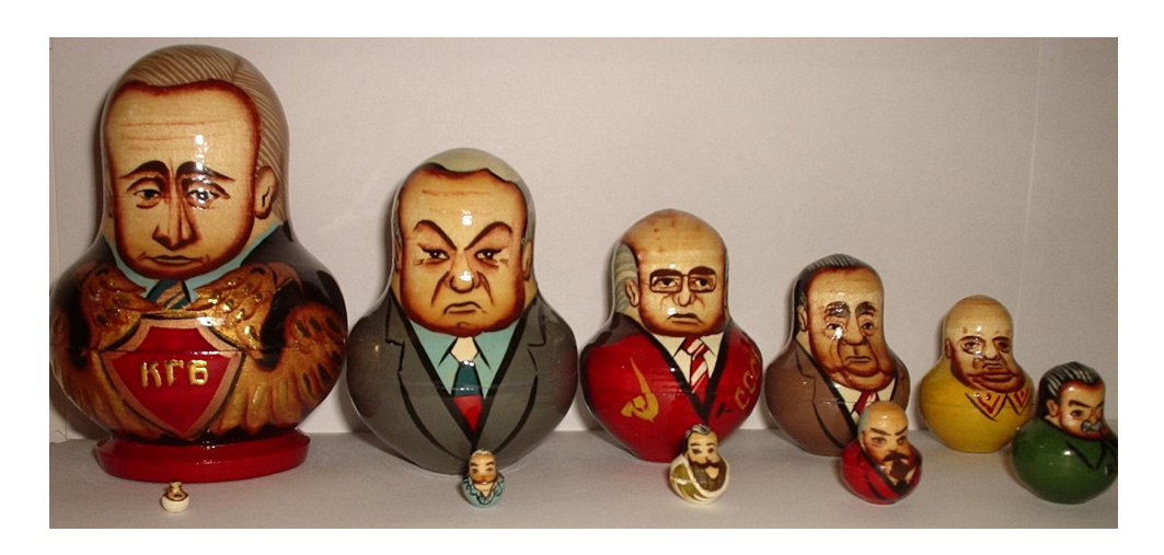
Fig. 2. Resilience maintenance as Russian Matryoshka dolls. Outside each resilience-maintaining process, there can be another process containing it, and monitoring and maintaining it... but is there a larger doll outside that doll, maintaining it?